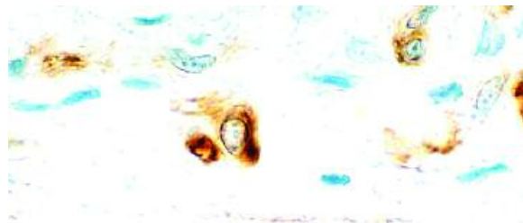
Figure 3 - Tumor cells in the central zone with the cytoplasm immunostained for smooth muscle actin. Nuclei are hematoxylin stained. (X 100).

Concerning the differential diagnosis with other tumours derived from myofibroblastically differentiated mesenchymal cells, low grade myofibrosarcomas should be considered first