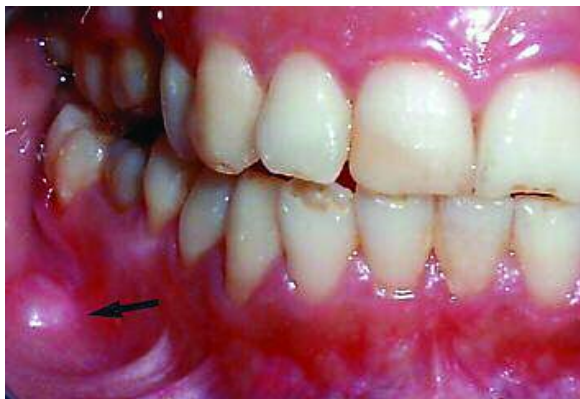
Figure 1 - The tumor (arrowhead) before excision